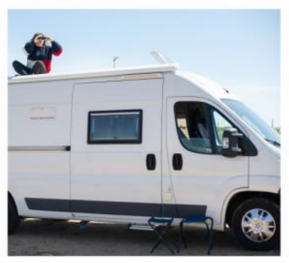
RV energy storage