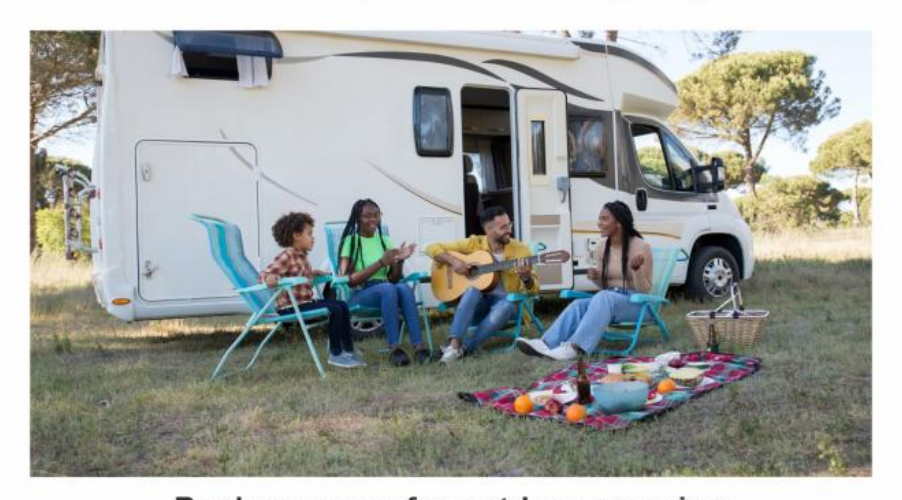
Backup power for outdoor camping