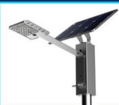
Solar Street Ligth