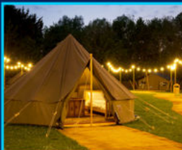
Household energy storage