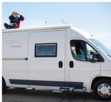
RV energy storage