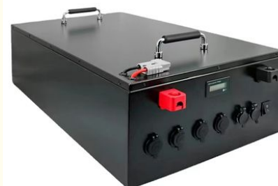
Energy storage lithium battery