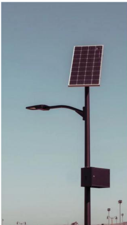
Solar street lamp