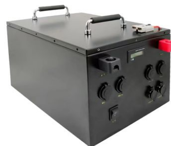
Energy storage lithium battery