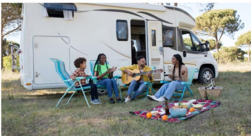
Backup power for outdoor camping