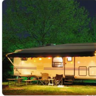
RV Energy Storage