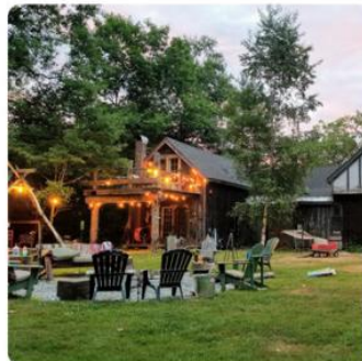
Home Back Up Electricity